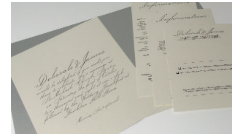
From bottom left clockwise: Block style layout, using hand written typeface, black interior ♦ Traditional layout, 3 insert cards, with marbled paper (supplied by customer) ♦ Main photograph shows Block style text in detail ♦ Sans Serif Block style text at the bottom of the front page, with a red interior ♦ Traditional layout, silver interior