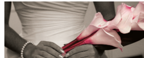
From bottom left, clockwise: Ivory folded invitation, with open square of 9 diamond crystals ♦ White Invitation, single card, with border and scatter line of diamond crystals ♦ Main picture: Off White invitation, with border and scatter line of sapphire crystals, ♦ Off White invitation, folded, printed in shades of pink, with amethyst crystals either side of RSVP ♦ Ivory invitation with diamond crystals placed at the end of the text ♦ White invitation, with border and random scatter of diamond crystals